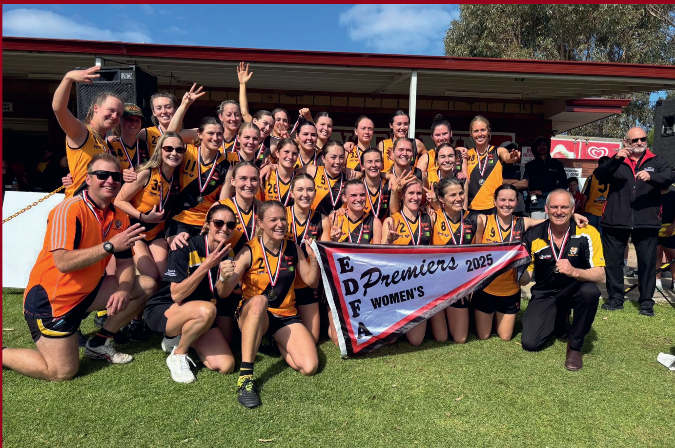
| Esperance Women