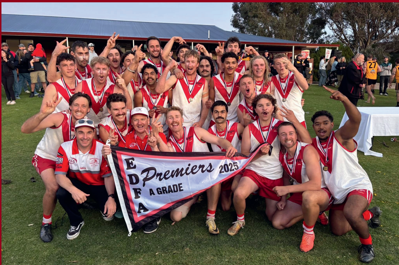
| Esperance Men