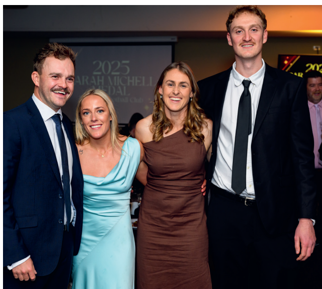
| Womens Coaches