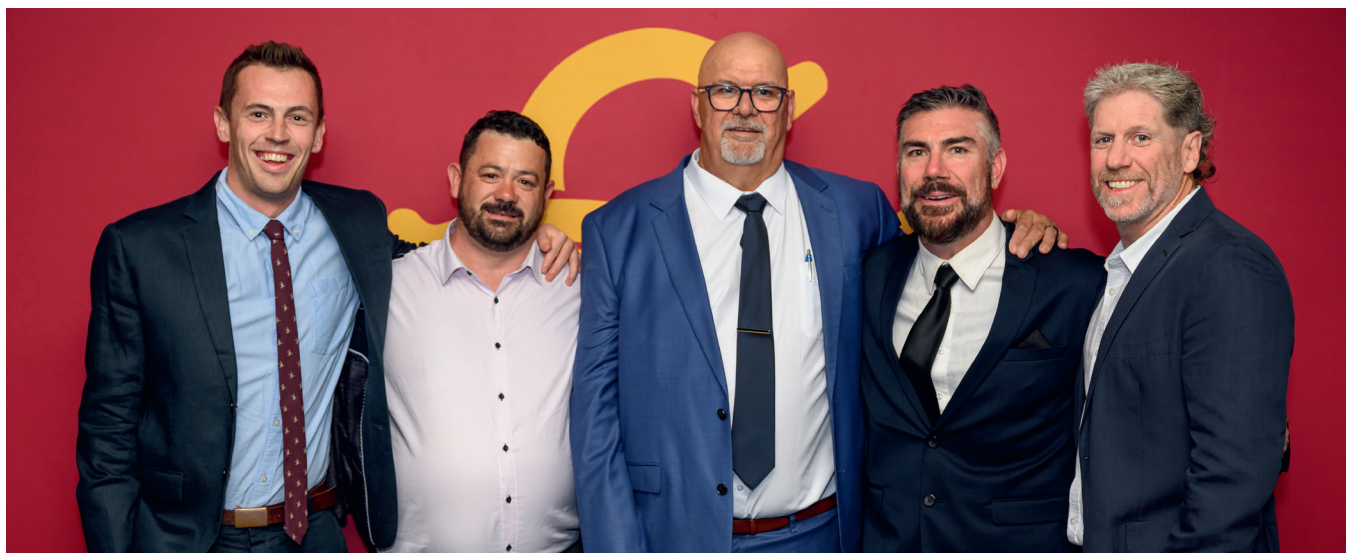
| Colts Coaches